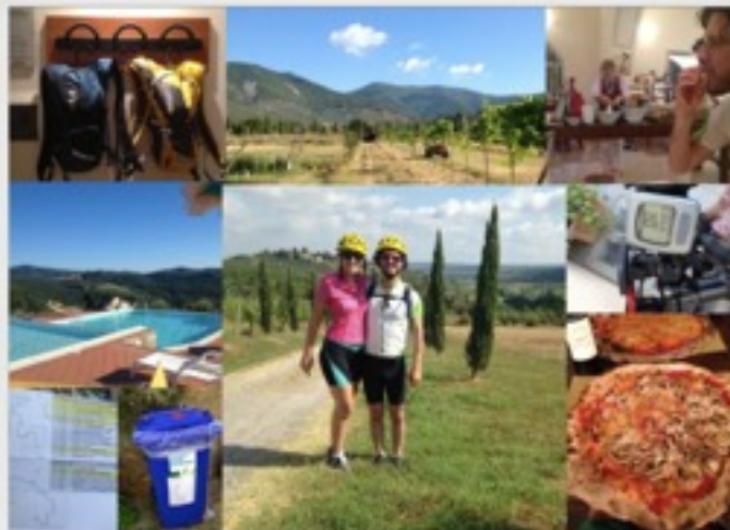
Biking through Tuscany!

While it wasn't completely energy-free (a diesel van moved our luggage from point to point along with other bikers' things doing similar trips), we ate extremely local, reused what we could, used the sun to dry out our laundry, and tried to keep our waste to a minimum. One of the best parts of Tuscany is that everything you find to eat is local. I did end up eating meat (and now I remember how good salami is!), cheese, and bread -- three things I don't normally eat, as there wasn't much of an option in the small towns (tofu does not exist there ha). But, it was delicious, and fresh, from the butcher down the street, and I felt good to be supporting the local economy. Since returning to SF I have also returned to vegetarianism but it was quite fun to eat like a local, I'll admit.